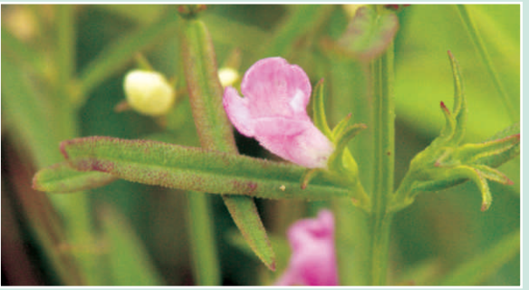
Straight, narrow leaves